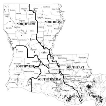
Figure 2. Statewide Flood Control Program Five Funding Districts for Rural Projects

b. Projects recommended to the Joint Legislative Committee will include a mix of those occurring in rural-undeveloped and rural-developed areas within each funding district as well as those for urban areas of the state. The method for allocating funding percentages within each district and the method for allocating total program funds to the various districts are presented in Subchapter D, Evaluation of Proposed Projects and Distribution of Funds.