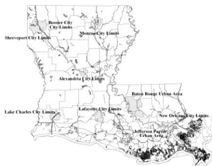
Figure 1. Statewide Flood Control Program Nine Urban Areas Funding Group

a. During this six month period, the Evaluation Committee will review and evaluate all completed applications in order to make recommendations to the Joint Legislative Committee on Transportation, Highways, and Public Works for funding. Applications will be divided into urban and rural categories. Applications for projects in the nine major urban areas comprise the urban category, as shown in the Figure 1, and compete against all other urban projects for funding. All other applications will be grouped by funding district as shown in Figure 2. Rural projects are subdivided into two categories, rural-developed and rural-undeveloped. Rural-undeveloped projects compete only against other rural-undeveloped projects in the same funding district and likewise for rural-developed projects. Proposed projects will be evaluated and ranked based on criteria established by the Evaluation Committee.