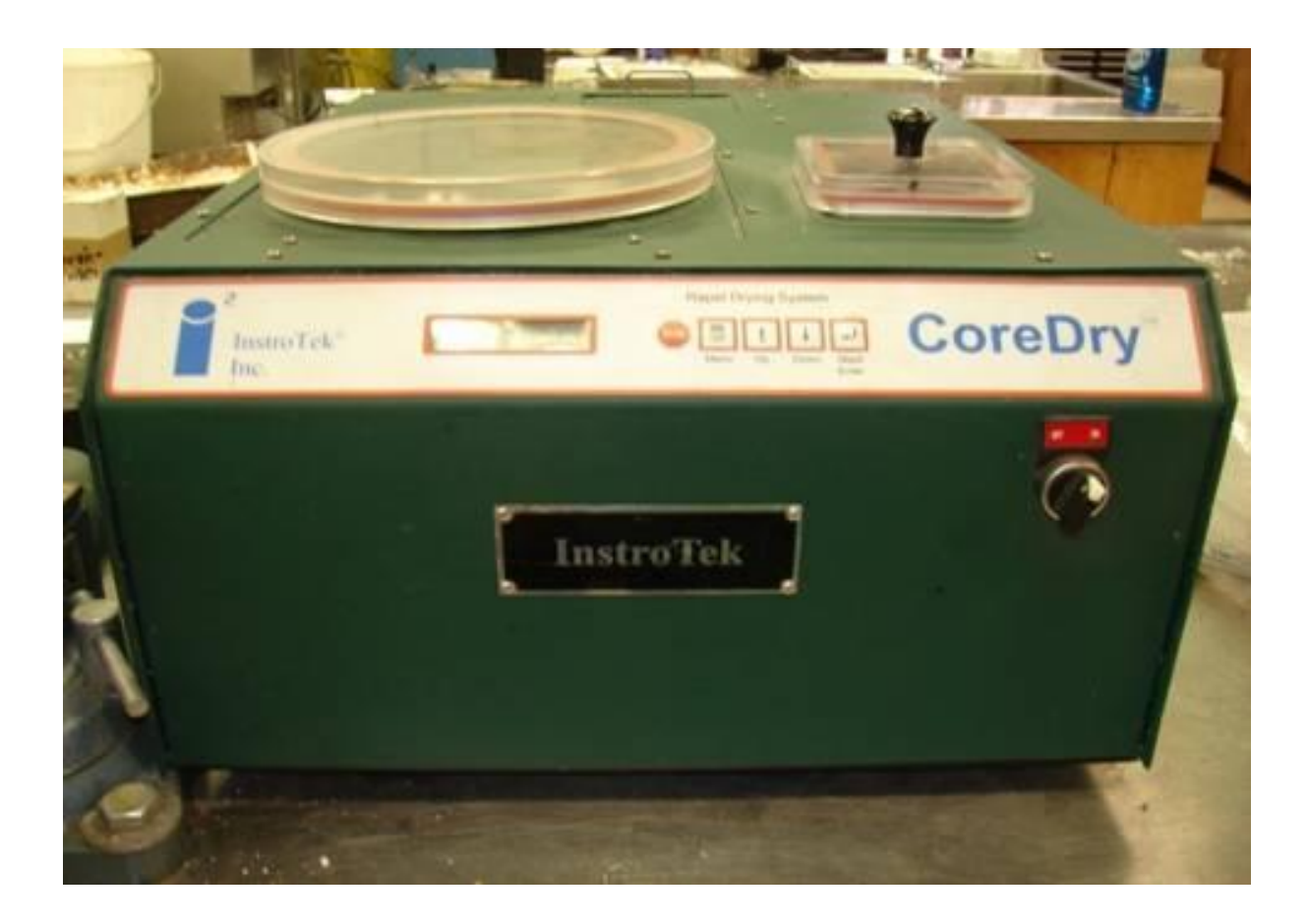
Figure 2 Automatic Sample Drying Machine