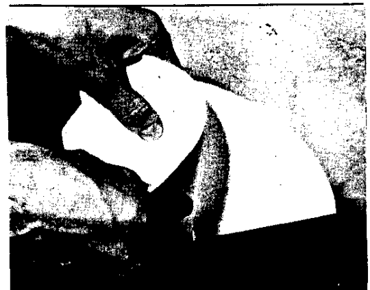
Figure 2 Folding Filter Paper