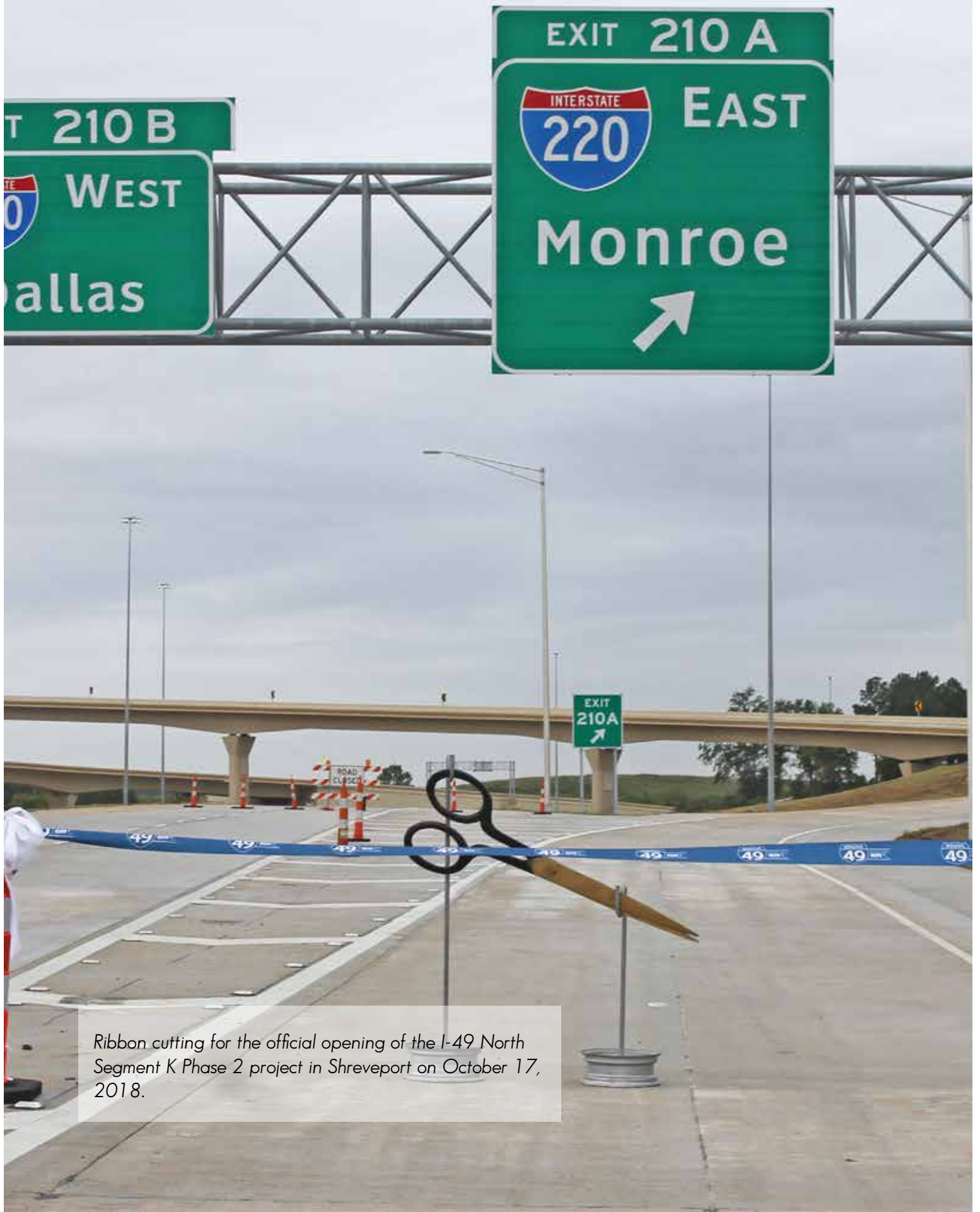
Ribbon cutting for the official opening of the I-49 North Segment K Phase 2 project in Shreveport on October 17, 2018.